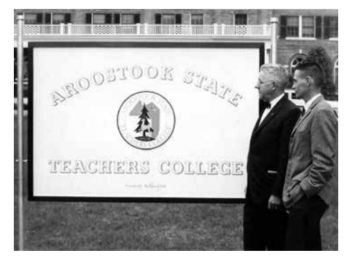
The University has been located in the same place for over 100 years but has operated under five different names: 1903 Atoostook State Normal School; 1952 Aroostook State Teachers College; 1965 Aroostook State College; 1968 Aroostook State College of the University of Maine; 1970 University of Maine at Presque Isle.

Also in 1968, the Aroostook State College of the University of Maine joined the National Association of Intercollegiate Athletics (NAIA) and the National Collegiate