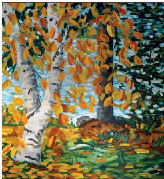
The Lake Pictures View 3