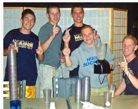
The UMPI Men's Soccer team was named #1 at the Mocktails event.

On Oct. 21 members of the men's and women's basketball teams and the men's soccer team took part in Mocktails n' Karaoke Night held in the Campus Center. From mixing non-alcoholic beverages to mingling and singing karaoke with teammates and fellow Owls, the athletes gave that Thursday night in Presque Isle a facelift. Another successful Alcohol Awareness week is in the books thanks to the Campus Activities Board, Health Services, Residence Life, Student Activities Office, and all of the participants who took part in the numerous, fun-filled events throughout the week. ★